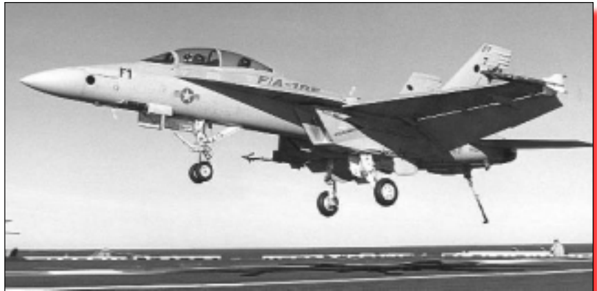
Every day ACF2 is used on the hydraulic systems of U.S. military aircraft.

Engineers will appreciate that this cleaner requires very few technical compromises. It delivers superior cleaning with the easy handling and storage of nonflammable solvents. It dries quickly and has very acceptable toxicity ratings with a negligible aroma. It is packaged in almost any dispensing technology the application requires. Aircraft