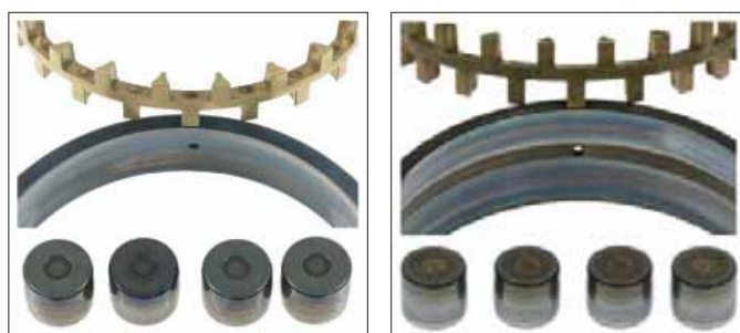
MOBIL SHC PM