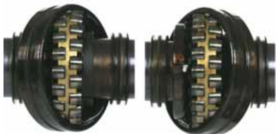
MOBIL DTE PM SERIES AVE BEARING RATING 6.5 DELTA KV @ 40°C 4.9%