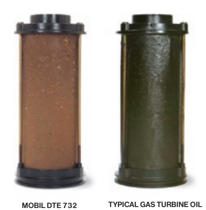
During proprietary simulated service testing, Mobil DTE 732 demonstrated superior deposit control.